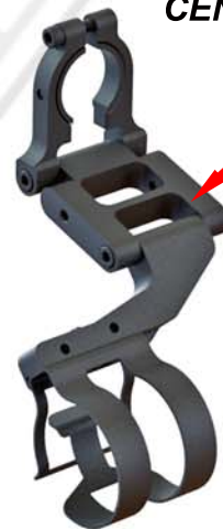
With center link installed