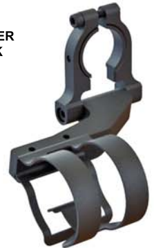
Without center link installed

4 - The center-link may be removed if an overall shorter mount length is needed, depending on your rear view mirror and desired position for the dashcam.